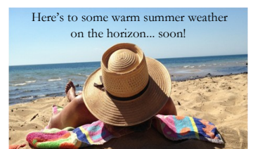
Here's to some warm summer weather on the horizon... soon!