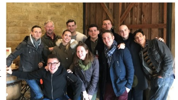
The Dream Team

Emersion visit by Sommeliers - Dinner by Heston & Rosetta